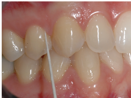
FIGURE 3: Example of drawings in the first upper premolar. The lips were moved with a cotton wool roll. Probing depth was collected with a paper cone from the mesial portion of the teeth.