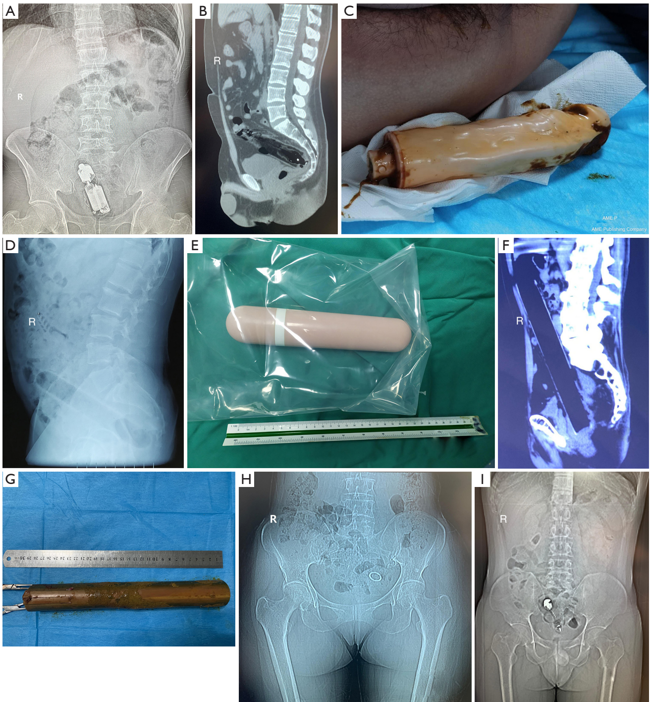
Figure 3 Rectal foreign bodies and imaging pictures. (A-C) Images of vibrators and the physical object in 2 cases; (D,E) image of an electric toothbrush and the physical object in 1 case; (F,G) image of a 30-cm long piece of bamboo and the physical object in 1 case; (H) a piece of date pit image that was stuck to the rectum wall in a 53-year-old female patient; (I) image of an IUCD that had migrated to the rectouterine space in a 57-year-old female patient. IUCD, intrauterine contraceptive device.