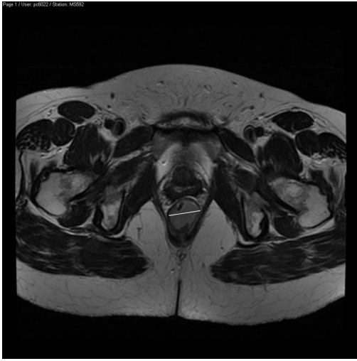
Figure 1 MRI of the anal canal showing the tumour.

ual tumour. Twelve months after completion of treatment the patient relapsed with liver and lung metastasis although the primary site remained clear. No response was seen to palliative chemotherapy and the patient succumbed to metastatic disease 18 months following the initial diagnosis.