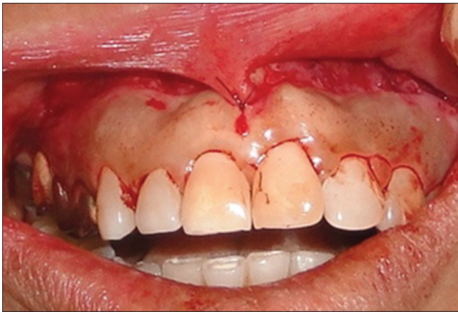
Figure 3: Stabilizing suture in the midline