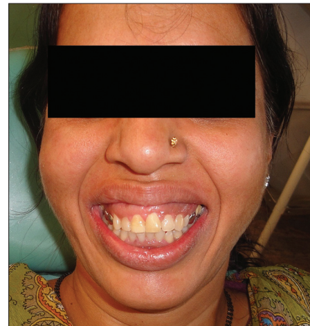
Figure 6: Pre-operative view (frontal)

excessive gingival display. [5,6] We feel that lip repositioning technique over other treatments not only improves patient compliance (cost-effective, least time consuming), but also gives good healing results. Furthermore, we feel that this technique has an edge over other techniques