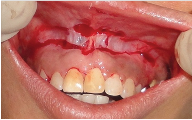
Figure 1: Partial thickness incision given