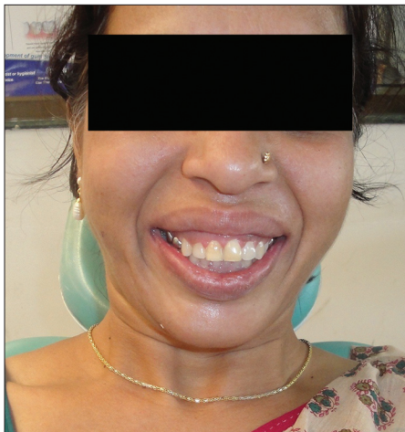
Figure 5: Post-operative view (frontal)

of the smile muscles is to use an alloplastic or autogenous separator, which is placed using nasal approach between the elevator muscles of the lip and the anterior nasal spine thus preventing the superior displacement of the repositioned lip. This procedure with nasal approach is taken up only in conjunction with rhinoplasty. [5]