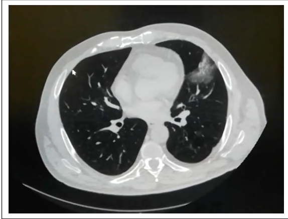
Figure 1. Thorax CT scan: left apical interstitial pneumonia.