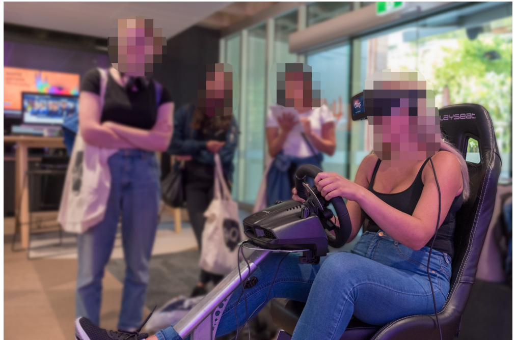
Fig 2. The VR driving simulator, adjusted for a participant's maximum comfort.

https://doi.org/10.1371/journal.pone.0250273.g002