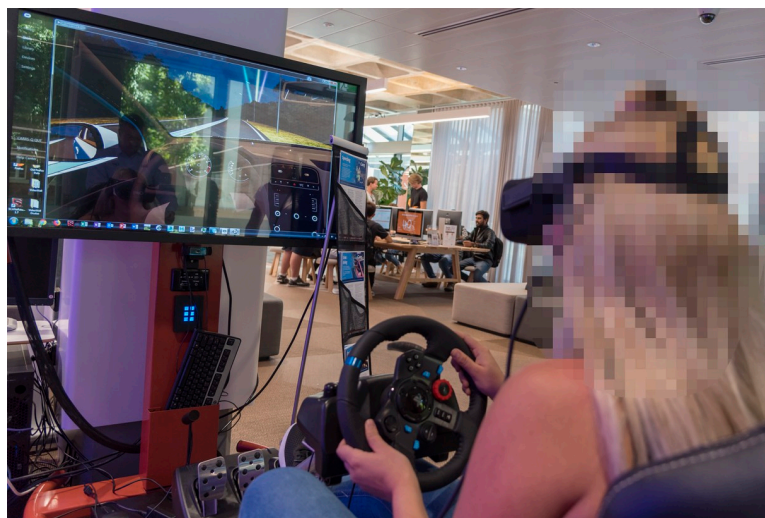
Fig 3. A participant is getting used to managing the VR driving simulator.

Initially, a participant would drive on a straight stretch of road without any other traffic participants. This experience was meant to give them time to get used to managing the VR driving simulator. It also served as the beginning of a plausible story, in which the participant was driving entirely sober to a night club (Fig 3).