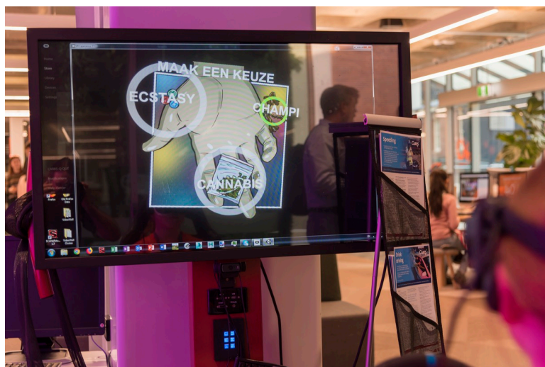
Fig 5. A choice to experience impaired driving as a result of ecstasy, cannabis or magic mushrooms influence is given to a participant.

https://doi.org/10.1371/journal.pone.0250273.g005