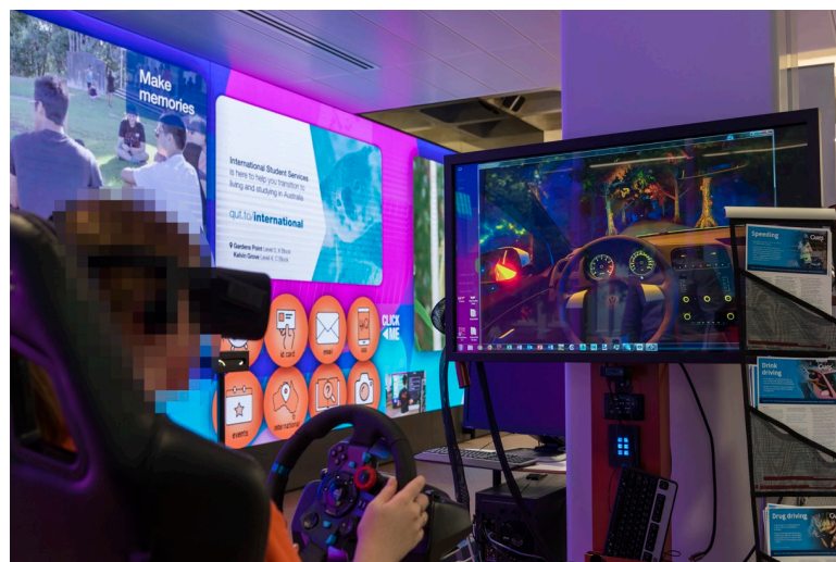
Fig 1. A participant, operating the driving simulator with VR software.

After the VR driving simulator was adjusted for a participant's maximum comfort, the VR software was started. Once started, the software would position the participant as sitting into the driver's seat of a four-seat light vehicle with a clear view of natural night scenery. When turning their head around, the participant will be able to see a 360-degree view both in the car and of the outside scenery. In the vehicle, there is an empty front passenger seat and an empty back seat. The virtual car driving wheel will turn simultaneously together with the Logitech