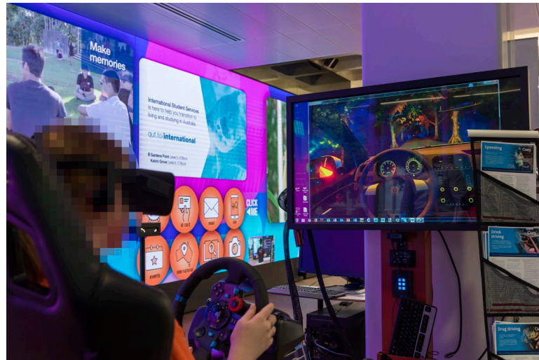
Fig 6. A participant driving under the VR-simulated influence of magic mushrooms.

https://doi.org/10.1371/journal.pone.0250273.g006