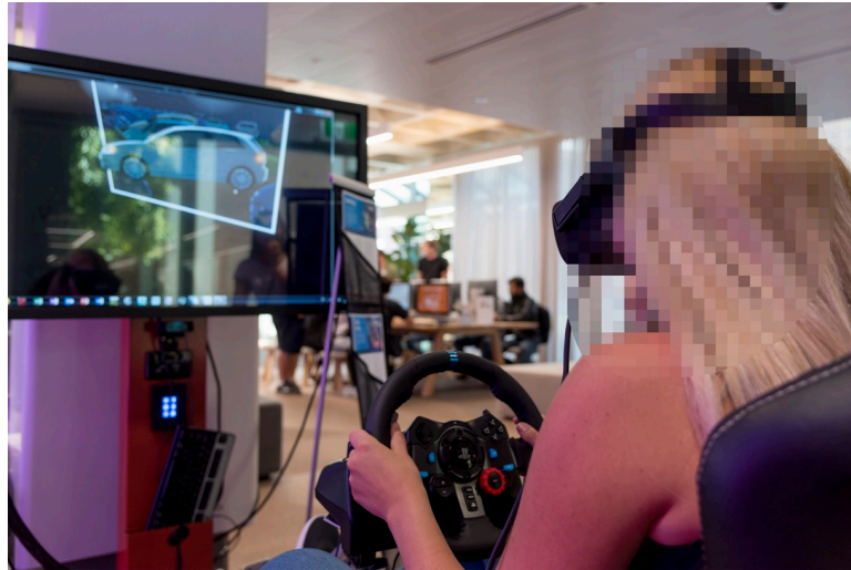
Fig 4. The VR software visualises parking of the vehicle before entering the night club.

https://doi.org/10.1371/journal.pone.0250273.g004