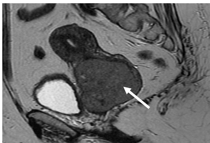
Figure 1. Lymphomatous cervical tumour invading the vaginal cavity: MRI (Magnetic Resonance Imaging) scan.

Whole-body imaging with CT (Computed Tomography) scan detected no secondary lesions in the solid organs or in the lymph nodes except for inguinal bilateral adenopathies less than 1 centimetre in diameter. The primary tumour was represented by an intensely iodophilic, dense vaginal mass of 3.4/2.9 cm with no changes of the uterus or the uterine adnexa. The MRI (Magnetic resonance imaging) scan confirmed the primary cervical tumour (Figure 1).