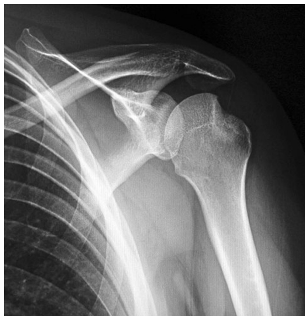
Fig. 1 The presence of a large Hill–Sachs lesion is well detected in internal rotation and is an indication for the open Latarjet procedure

The surgical steps for this procedure have been described previously by the senior author [2]. However, it is important to stress some concepts. First of all, this open procedure has a very low impact on soft tissues since we avoid releasing the subscapularis and perform a horizontal split of its fibers at the junction of the superior one-third with the inferior two-thirds. This avoids fatty degeneration