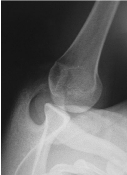
Fig. 2 Bernageau view shows the exact anterior contour of the glenoid socket. Blunted angle sign refers to the loss of the sharp profile of the anteroinferior glenoid rim

of the subscapularis muscle, as was demonstrated by Maynou [4].