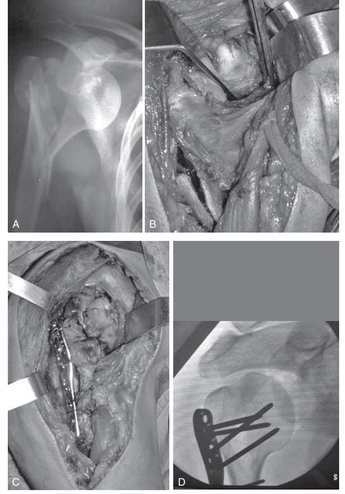
Figure 1 – A) Radiograph showing fracture into three parts with anterior dislocation. (B and C) Intraoperative appearance of the fracture and dislocation after reduction and osteosynthesis with a Philos plate. D) Intraoperative fluoroscopic image.

All surgeries were performed under general anesthesia and with a scalene block for postoperative analgesia. Prophylactic antibiotic therapy (cephalosporin) was initiated with the anesthetic induction, lasting for 24 hours after the surgery. Patients were positioned supine, in the beach chair position, on a