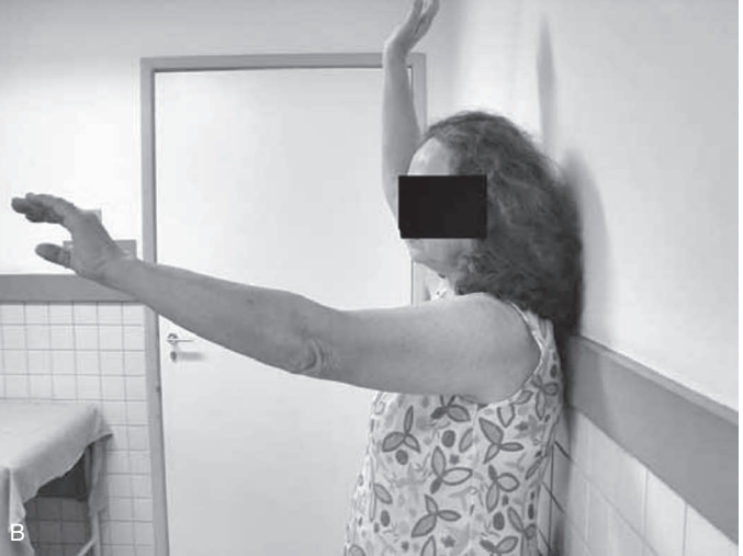
Figure 4 – A) Radiograph of the shoulder showing a consolidated fracture with varus deviation. B) Patient showing decreased range of motion of the shoulder.

presented pelvic bone fractures evolved with deep vein thrombosis of lower limb, which was treated with medication.