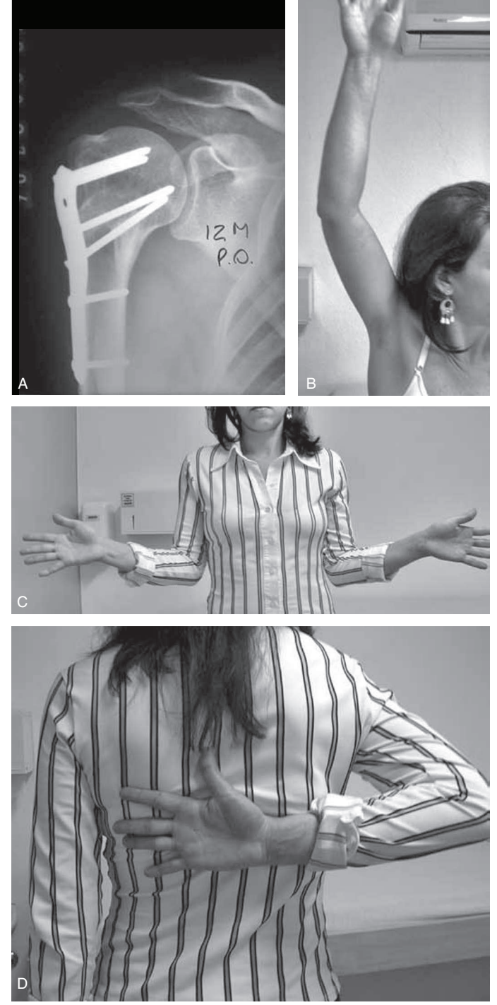
Figure 3 – A) Radiograph of postoperative fracture treated surgically with Philos plate. B, C and D) Functional outcome after one year of surgery.

varus angulation (Figure 4), the UCLA functional score of these patients averaged 27 points. When these three patients were evaluated in isolation, their mean active anterior flexion was 110°, their mean lateral rotation was 28°, and internal rotation averaged T11. There were no complications such as avascular necrosis, nerve damage, or infection. The patient who