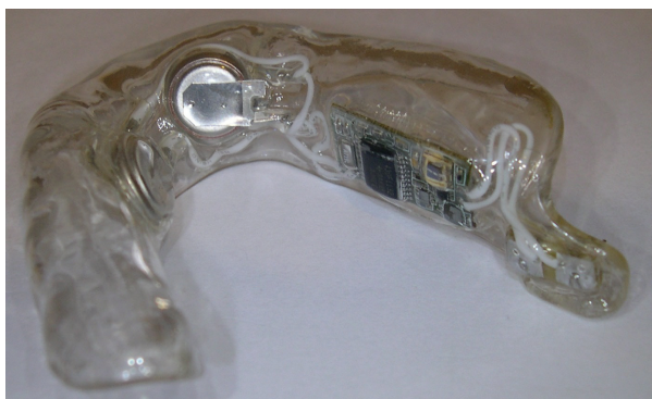
Fig. 3. The GenNarino device with the rectangular electronic circuit on its right side and the round battery on the anterior part. A pair of stimulating electrodes protrude from the buccal surface on the extreme right side extension (not shown in this lingual view-picture). The latter are positioned in such a manner that they are in contact with the oral mucosa in the mandibular third molar area, in the immediate proximity to the lingual nerve. As the flange is separated from the mucosal surface, the electrodes don’t prick the tissue.

Note that sympathetic nerves can be expected to act on the glands as well, as an effect of the stimulation of the reflex arc. Reflexly elicited sympathetic impulses, originating from the upper thoracic paravertebral sympathetic trunk, reach their targets via sympathetic nerve fibers following the arteries of the glands; the relay between pre- and postganglionic sympathetic fibers is the superior cervical ganglion. However, the minor glands are thought to lack a sympathetic innervation of their acinar cells (12).