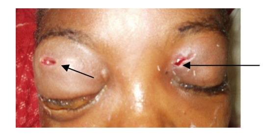
Figure I Photograph of patient following orbitotomies. Note bilateral exophthalmia, bilateral chemosis and bilateral eyelid oedema. The two arrows are pointing at the two orbitotomies.

Ophthalmic consultation was sought 4 days later. It revealed fistulization to the left upper eyelid. Needle aspiration