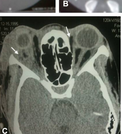
Figure 2 (A) Frontal sinusitis, (B) maxillary sinusitis, and (C) bilateral intraorbital abscesses.

of the right orbit yielded 2 mL of purulent material. Bilateral superior orbitotomies were performed and the abscess evacuated. Microscopy of surgical material revealed acute inflammatory cells mixed with a few clusters of Gram-positive cocci. Culture was negative. Topical fucidic acid was given and dressings applied daily. Artificial tear drops were also given for corneal exposure.