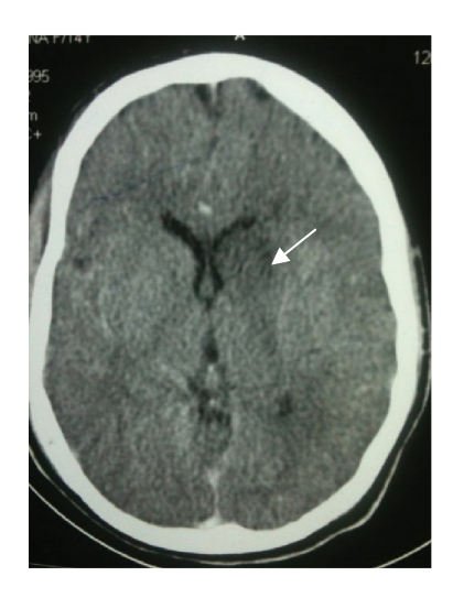
Figure 3 Left internal capsule infarct.