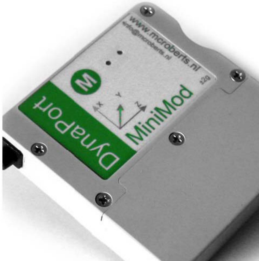
Figure 2 The accelerometer used in the present study. A DynaPort portable tri-axial accelerometer (McRoberts, The Hague, NL) was placed on the lower back to measure accelerations, the input to the near falls algorithms.

defined as the difference between the maximum and minimum acceleration derivatives (see, for example, Figure 3). The standard deviation of the signal in each gait interval was also determined. In addition, step regularity, stride regularity, and symmetry were calculated, as previously described [30].