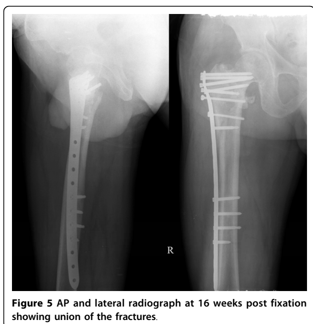
Figure 5 AP and lateral radiograph at 16 weeks post fixation showing union of the fractures.

metaphyseal and osteoporotic bone). This biomechanical prerequisite of conventional plates is associated with biological pitfalls due to compression of periosteal blood supply and compromise of the vascularity of the fracture. In contrast, LISS could avoid these problems.