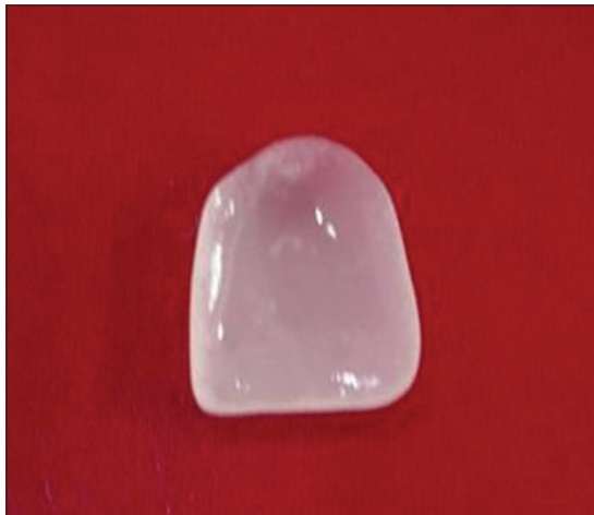
Figure 1: Nano-hybrid componeer shells

Veneering was kept supragingival for both the groups. The shape, size, and shade of the componeers were customized using a contour guide, so as to match the contour and size of patient's existing teeth and cosmetic requirements. The contour guides were available in 36 different shapes and small, medium, large, and extra large sizes. The assessment was done by placing the contour guide over the tooth to be restored and assessing the mesiodistal and incisocervical fit [Figure 3]. The color of the guide was transparent blue, which enabled optimum contrast on the tooth. Facial aspect of componeers, being extremely thin (0.3 mm), was not altered. Only their proximal and cervical margins were minimally trimmed to custom fit the proximal and cervical aspects of the prepared tooth surface. The clinical performance of componeers in Group A and direct composite veneers in Group B was evaluated and compared for the aforementioned parameters at 0- (immediately post veneering) 3-, 6-, 9-, and 12-month interval. Figure 4a-d depicts a "Group A" case rehabilitated with componeers.