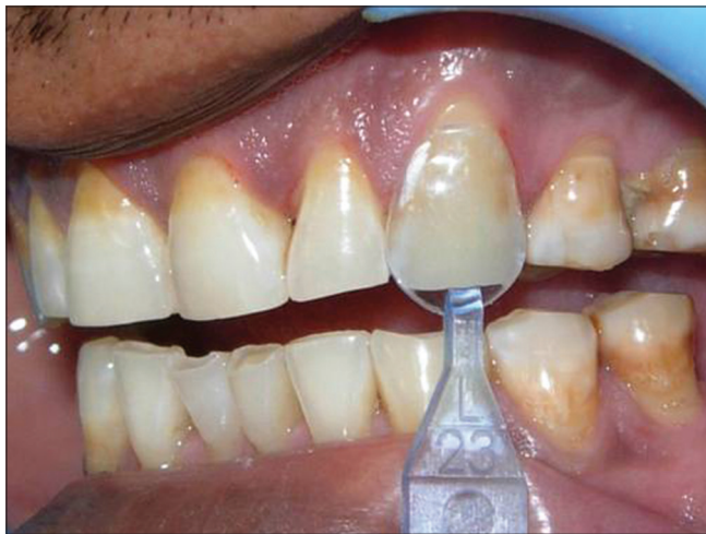
Figure 3: Assessment of mesiodistal and incisocervical fit of the componeer using the componeer contour guide

Figure 5a-d depicts a "Group B" case rehabilitated with direct composite veneers.