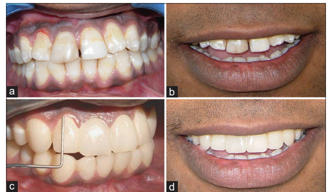
Figure 4: Group A – rehabilitation with componeers. (a) Preoperative intraoral labial view. (b) Preoperative extraoral labial view. (c) Postoperative clinical evaluation. (d) Postoperative extraoral labial view