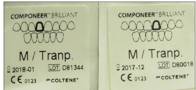
Figure 2: Componeer blister packs depicting the tooth number, size, and shade

Tooth preparation was minimally invasive for both the groups and in accordance with prescribed guidelines for