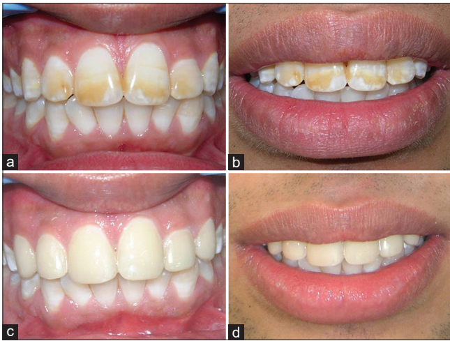
Figure 5: Group B – patient rehabilitation with direct composite veneers. (a) Preoperative intraoral labial view. (b) Preoperative extraoral labial view. (c) Postoperative intraoral labial view. (d) Postoperative extraoral labial view

veneer preparation. [4,5] Etchant Gel S (phosphoric acid 35%) was applied to prepared tooth surface for 30–60 s, followed by water spray for 20 s. Excess water was removed with oil-free air. Interdental matrices were placed and “One Coat Bond SL” (single-component bonding agent) was applied to the prepared tooth, left for 20 s, blow dried with oil-free air, and light cured for 30 s. The same was applied on the contact side of the componeer also, left for 20 s, and blow dried with oil-free air but not light cured (to ensure wettability). The selected composite resin shade was applied with the “MB5” modeling instrument to the contact side of the componeer and to the tooth to prevent air inclusions. Componeer was positioned on the tooth under gentle pressure using a placer instrument. Excess material and interdental matrices were removed and light curing done for 40 s on palatal and facial aspects, respectively. Margins were trimmed with flame-shaped diamond points. Finishing and polishing strips were used for the proximal regions, flexible discs for incisal angles, and silicone rubber polishers for obtaining high gloss. Cervical margins were thoroughly polished to prevent plaque accumulation.