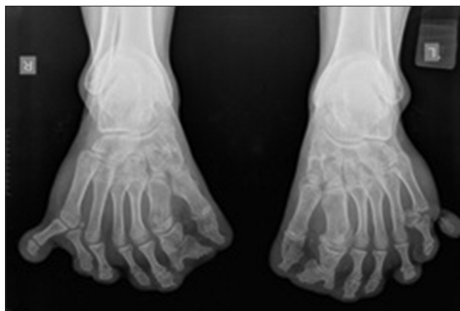
Figure 6: X-ray of foot shows polysyndactyly and bilateral duplication of hallux

The authors certify that they have obtained all appropriate patient consent forms. In the form the patient(s) has/have given his/her/their consent for his/her/their images and other clinical information to be reported in the journal. The patients understand that their names and initials will not be published and due efforts will be made to conceal their identity, but anonymity cannot be guaranteed.