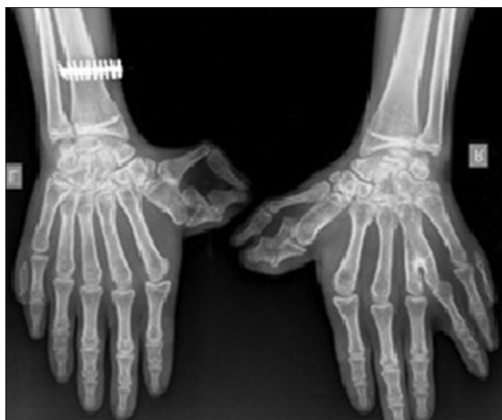
Figure 5: X-ray of hand shows polysyndactyly and bilateral duplication of thumbs

OFD I. The histopathology of tongue nodules of OFD II would be either hamartoma or lipoma. Although both OFD I and OFD II may present with porencephaly, corpus callosum agenesis is not seen in OFD II. Conductive hearing loss, typically not seen in OFD I, has been reported in OFD II. [9] OFD I is the only type in which renal cysts occur which grossly resemble adult polycystic kidney disease, although sometimes types VI and VII may also manifest with renal abnormalities. [10]