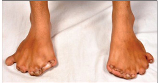
Figure 2: Clinical image shows bilateral polysyndactyly of halluces