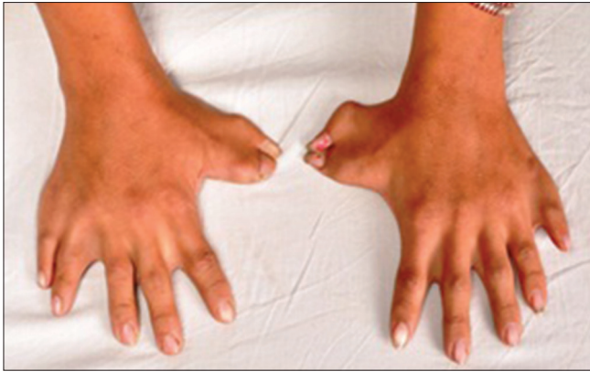
Figure 1: Clinical image shows bilateral polysyndactyly of hand, bilateral duplicated thumbs