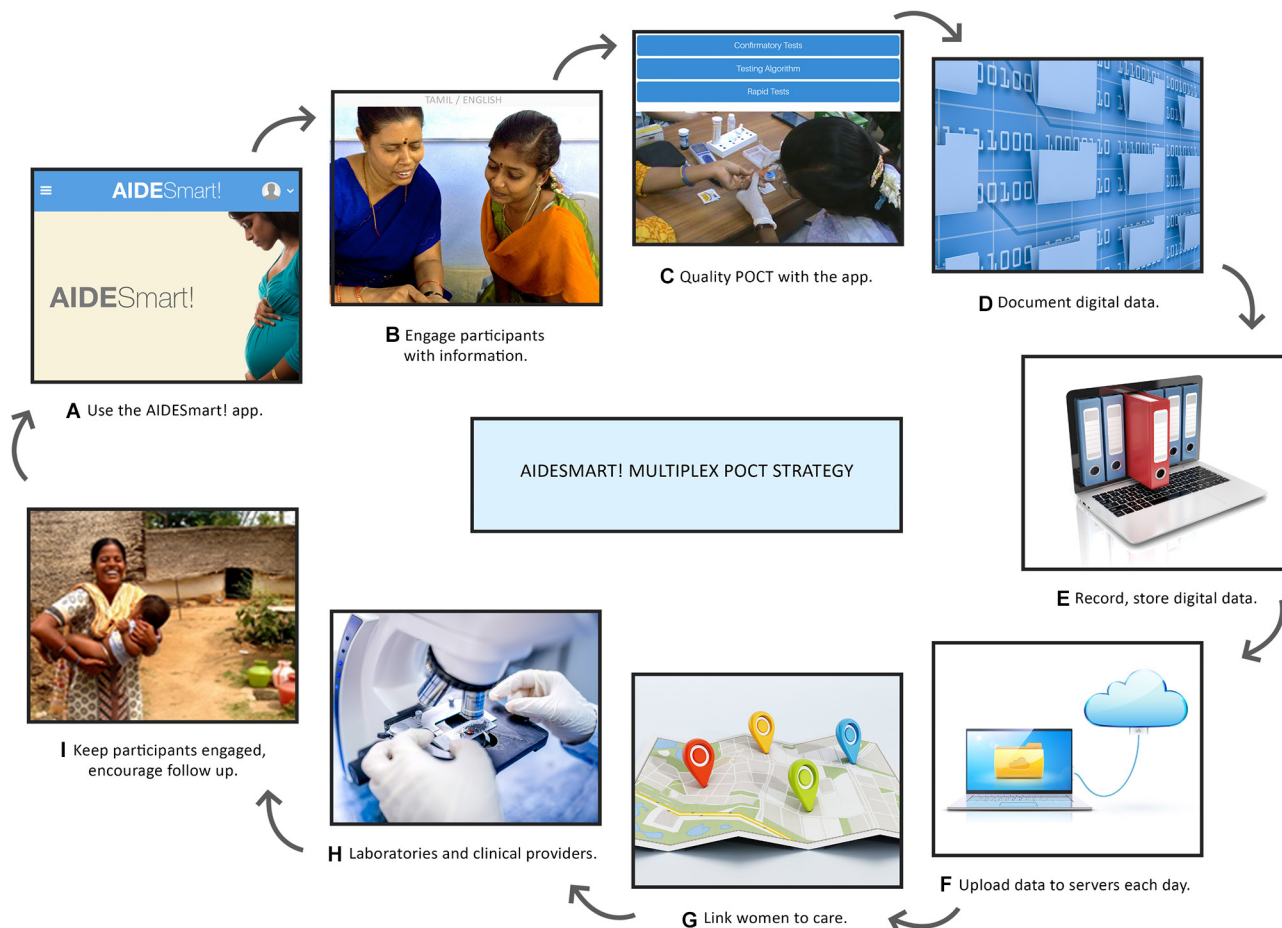
Figure 1 Complete AideSmart! multiplex POCT strategy performed by HCPs. HCPs, healthcare professionals; POCT, point-of-care test.