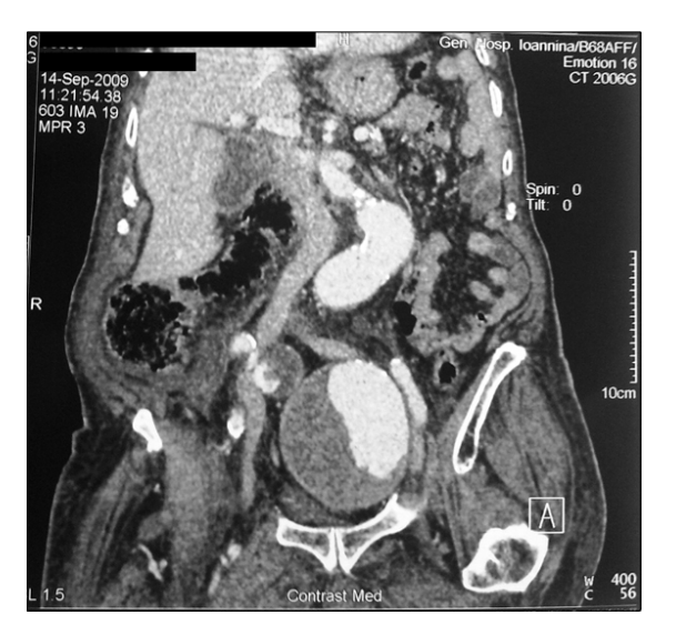
FIG. 2. Contrast-enhanced abdominal CT scan showing an abdominal aortic aneurysm and internal iliac artery aneurysm (coronal view).

aneurysm contained a peripheral thrombus, whereas the aortic aneurysm was partly calcified (Fig. 4). Inflammatory changes were present in the lower right peri-renal area. The right iliopsoas muscle was enlarged and of a heterogeneous texture. There was adjacent soft tissue swelling.