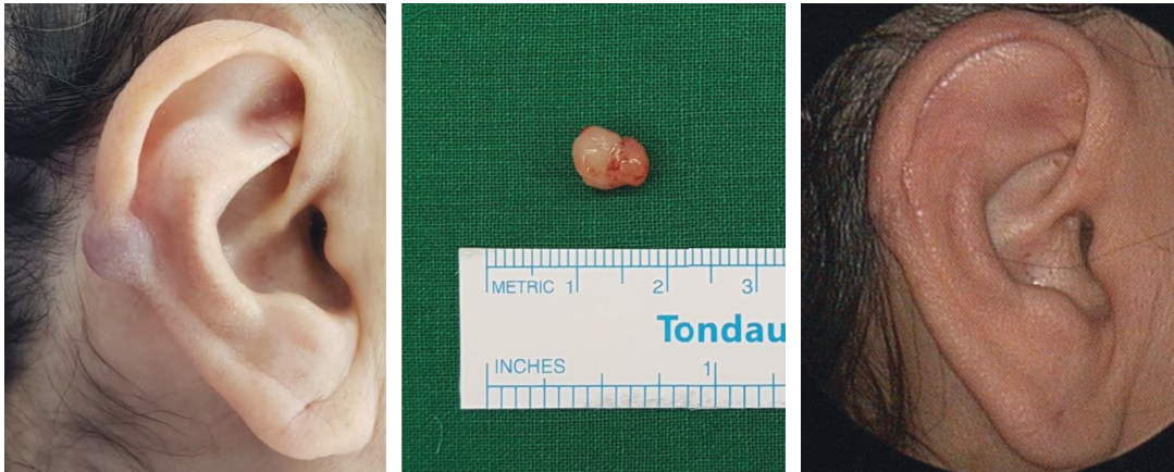
FIGURE 1: A soft and cystic mass with purple skin discoloration in the helix of the right auricle (a). Surgical specimen of the 0.8 \times 0.6 cm, whitish, soft, cystic mass (b). Postoperative wound which healed well after 2 months (c).