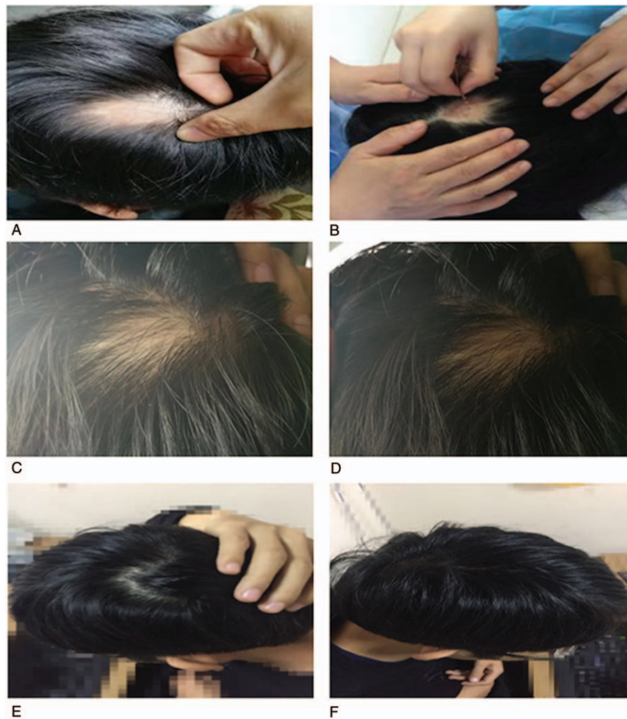
Figure 2. Patchy hair loss affecting the vertex 5.0 \times 3.2 cm. This picture was taken during the first treatment (A). The performance of Zhuang medicine medicated thread moxibustion of at the patient's Kuihua acupoint on his head in the first week (B). The second week of Zhuang medicine medicated thread moxibustion treatment (C). The third week of Zhuang medicine medicated thread moxibustion treatment (D). Fourth week of Zhuang medicine medicated thread moxibustion treatment (E). The follow-up period was 3 months after the end of treatment (F).

When the sparkle was extinguished, the thread was picked up immediately; this called 1 Zhuang. Repeating this sequence of steps, moxibustion was performed at the above 5 acupoints in turn. Each acupoint was cauterized 2 times, once every 2 days for 4 weeks. After moxibustion on the day of treatment, the patients were told to not scratch or wash their heads with water. Additionally, the patient was instructed to stay relaxed throughout the treatment period and to participate in the follow-up for 3 months.