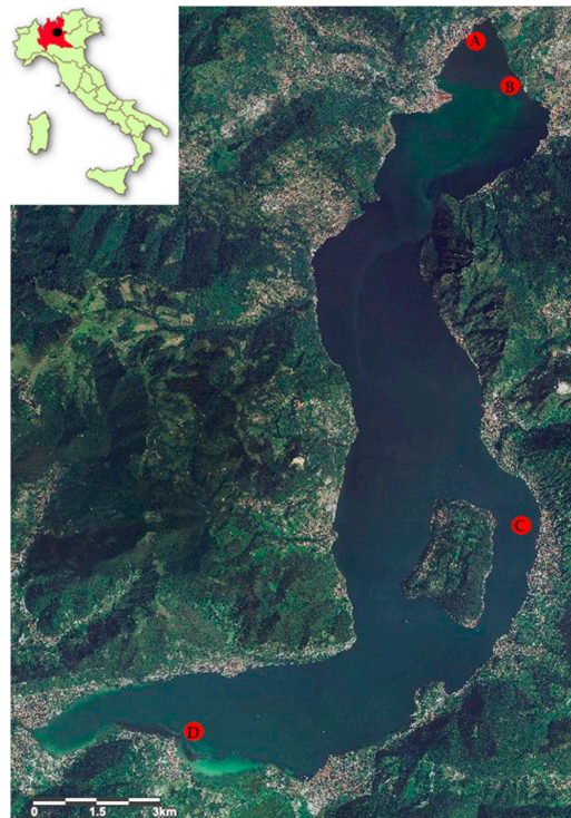
Figure 1. Lake Iseo (Lombardy, Northern Italy) and location of sampling sites (in red). A: Costa Volpino (northern area, 45°49'01.2" N 10°05'18.1" E); B: Pisogne (northern area, 45°48'26.8" N 10°04'23.0" E); C: Carzano (central area, 45°42'48.3" N 10°05'48.5" E); D: Clusane (southern area, 45°39'45.3" N 10°00'46.2" E).