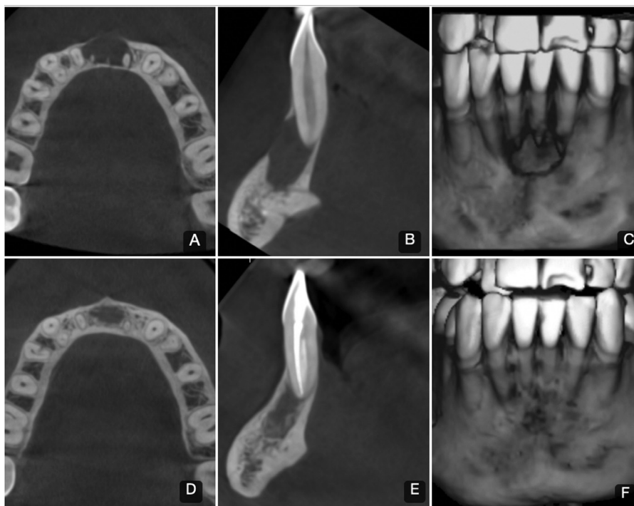
Fig. 1: CBCT images of Clinical Case #1. A-B-C; Axial and sagittal view and three-dimensional reconstruction of the pre-treatment state. D-E-F; Axial and sagittal view and three-dimensional reconstruction of the post-treatment state after 6 months. Considerable diminution of the mesio-distal width can be observed, with peripheral areas of bone neoformation, recovery of lingual plate thickness and complete closure of the vestibular fenestration.

Dry intracanal disinfection was then performed with DL (940-nm) (EpicX, Biolase, USA), using 200 \mu m tips and power 1.0W. The tip was positioned -1mm from the work length, irradiating the root canal with an apico-coronal spiral movement at 1mm per sec, with 4 repetitions (10 sec between applications) (Fig. 2). Once dry, the canal was treated with calcium hydroxide (Ultracal XS, Ultradent, USA). PBMT was then applied with DL (940-nm) (EpicX, Biolase, USA), with one spot of 0.2