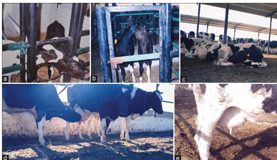
Figure-1: Photos from calves and cows involved in abnormal oral behavior. (a, b) Cross-sucking in calves after bucket feeding, (c) A cow engaged in self-sucking while the rest of the group was feeding), (d) A cow is sucking its neighbor, (e) teat elongation in a cow was involved in self- and cross-sucking.