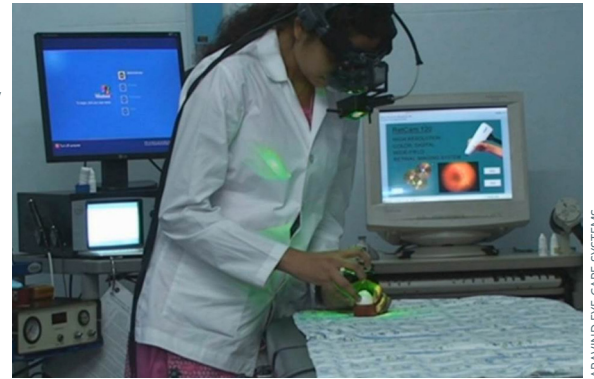
Figure 1 ROP trainee practising indirect laser on RetiEye.

Aravind Coimbatore was the first institute in India to get the RetCam 120 digital fundus imaging camera in 2003 and infra-red diode (810 nm) laser was also added in the following year. Use of intra-vitreous injection of anti-vascular endothelial growth factor (VEGF) was introduced in 2006. As the number of ROP cases increased over a period of time, a separate Paediatric Retina Clinic was inaugurated. A month-long ROP training programme was initiated, wherein candidates are trained to examine infants using indirect ophthalmoscopy and practice indirect laser on the RetiEye Model eye (AuroLab, Madurai, India) (Figure 1). So far 54 candidates from India and abroad have been trained