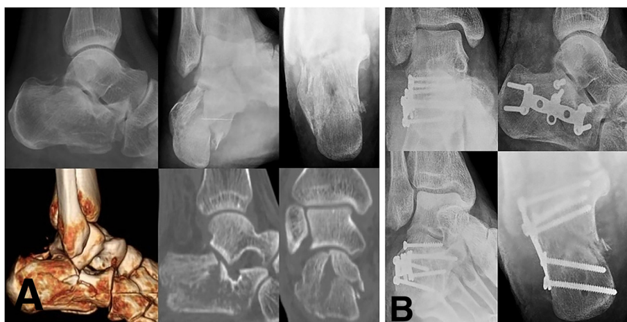
Figure 3 Radiologic evaluations of 52 year old male patient with Sanders type-II intra-articular calcaneal fracture treated with open reduction and internal fixation using the extensile lateral approach. (A) Preoperative plain radiographs and CT scans (B) Postoperative plain radiographs.

The most popular approach for the open reduction and internal fixation of calcaneal fracture has been the ELA [9,12,13,23]. This approach provides excellent visualization and allows access to manipulate and rigidly