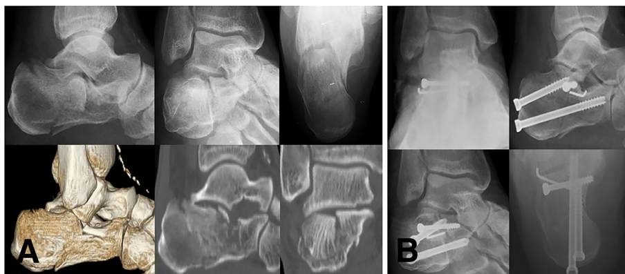
Figure 2 Radiologic evaluations of a 55 year old male patient with Sanders type-II intra-articular calcaneal fracture treated with open reduction and internal fixation using the sinus tarsi approach. (A) Preoperative plain radiographs and CT scans (B) Postoperative plain radiographs.

but no patient required intervention. One case of peroneal tendinitis was observed in the ELA group. However, no patient required operative treatment. No peroneal tendinitis was observed in the STA group. Five (8.3%) of 60 patients in the ELA group complained of subtalar stiffness, and one required exploration and arthroscopic subtalar release. The indications of arthroscopic subtalar release were isolated subtalar stiffness with pain on weight bearing which was aggravated by walking on uneven ground; articular incongruity less than 2 mm at the posterior facet of the subtalar joint on CT scans; and failure to respond to conservative treatment. The procedure was debrided of fibrous tissue in the sinus tarsi and lateral gutter and released the posterior talocalcaneal facet. Arthroscopic subtalar release was performed before posttraumatic arthrosis occur [22]. Four patients reduced their pain by doing subtalar circle