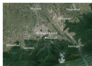
Figure 1. Aliabad Katoul and Surrounding Regions (Latitude: 36^{\circ}53'52.29'' N, Longitude: 54^{\circ}53'9.94'' E)

The city of Aliabad Katoul and its related villages are located in a semi-jungle region, as shown in Figure 1. This city relies on several rivers, waterfalls, and wells to supply the drinking water for its populace.