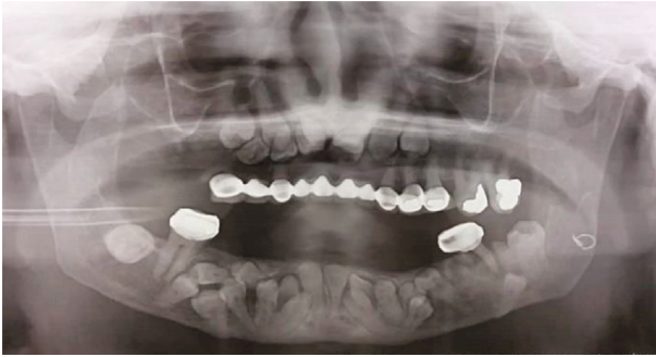
FIGURE 3: Panoramic radiograph before treatment.