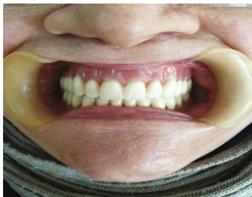
FIGURE 8: Final oral rehabilitation with removable partial denture.

prolong their life, the patient was trained in two sessions on how to maintain the oral and denture hygiene in good condition. Also, the patient was advised to use prostheses except when asleep. An appointment was scheduled after a week for the final adjustment (Figures 9(a) and 9(b)).