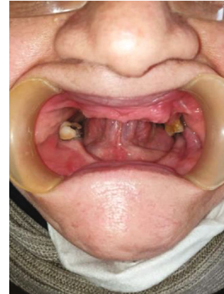
FIGURE 5: Intraoral photograph before prosthodontic treatment.

Preliminary impressions were made for both arches using irreversible hydrocolloid impression material (CA37; Cavex Holland BV, Haarlem, Netherlands) in a stock tray. Impressions of both arches were poured to obtain study casts by dental plaster type 2 (Pars Dandan, Iran). Acrylic custom trays were made using auto polymerizing acrylic resin (Bisico-Germany). In the second visit, both custom trays were border molded using green stick compound, the definitive impression was recorded with Panasil initial contact light impression material (Kettenbach, Germany), and final