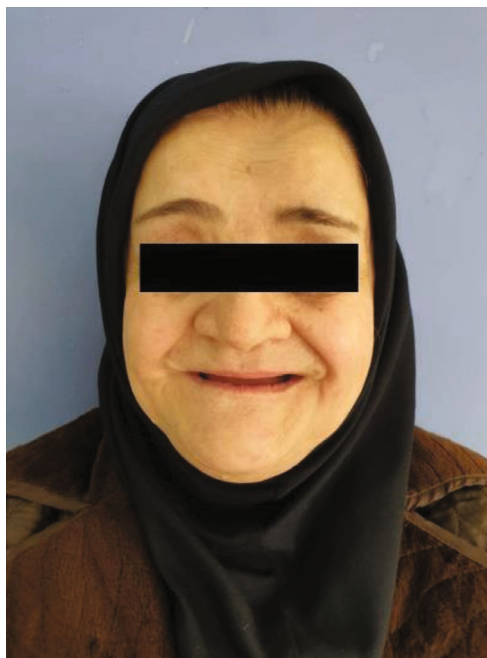
FIGURE 1: Mandibular prognathism with depressed nasal bridge and frontal prominence.

Radiographic findings revealed multiple impacted permanent teeth in the anterior region of maxilla and anterior and posterior regions of the mandible as well as the fracture of the left angle of the mandible which had been fixed with