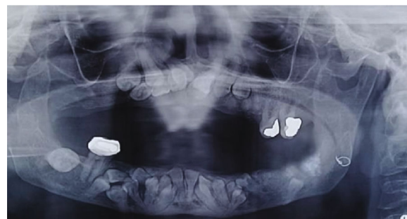
FIGURE 6: Panoramic radiograph 3 months after teeth extraction.