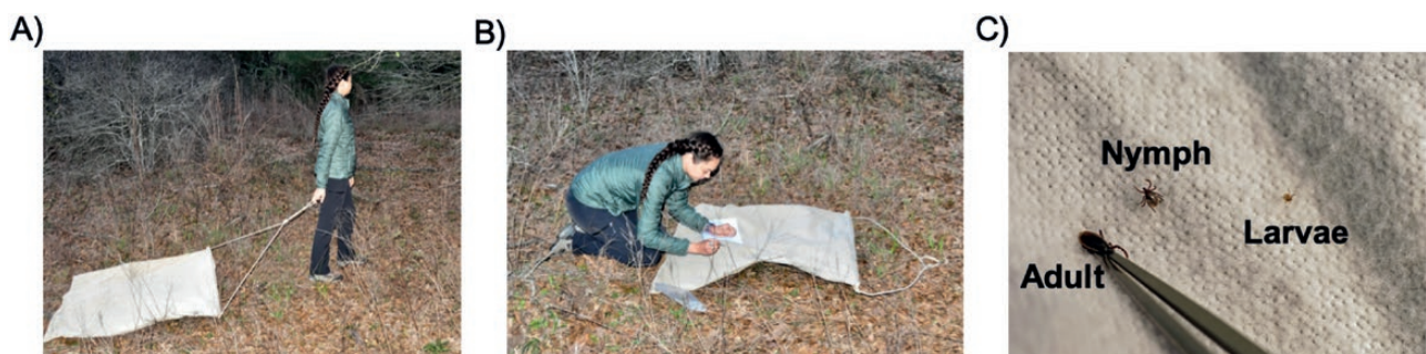
Fig. 1. Demonstration of tick dragging in the field. The series of panels show (A) walking to the pace of the ‘wedding march’ (approximately 50 m/min, a 30-min mile, or 1.8 miles/h) with the drag cloth trailing behind the collector, (B) pausing after 15 m to remove any collected ticks, and (C) a size comparison of Ixodes pacificus at each life stage to demonstrate the differences in size of the three tick life stages.