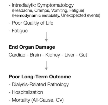
FIGURE 2: The various origins of multisystemic stress induced by HD therapies can be divided into two main categories, hemodynamic and non hemodynamic. DISS acts as a negative disease modifier to worsen long-term outcomes and contributes significantly to end damage of vital organs and the symptom burden of HD patients.