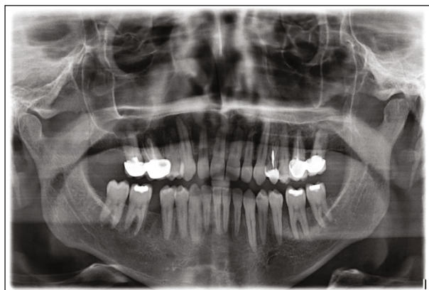
FIGURE 1: Pretreatment panoramic radiograph of initial patient presentation.

After sintering, the framework was seated on the cast after minor corrections, and then, the marginal fit and internal fit were checked intraorally using an explorer and a silicone indicator paste (Fit Checker, GC Corp). The silicone indicator paste exhibited a homogeneous and thin thickness which was accepted. For the inlay retainer, the minimum thickness was 3 mm, and for the buccal and lingual retainer wings, it was 0.7 mm. The dimensions for the proximal con-