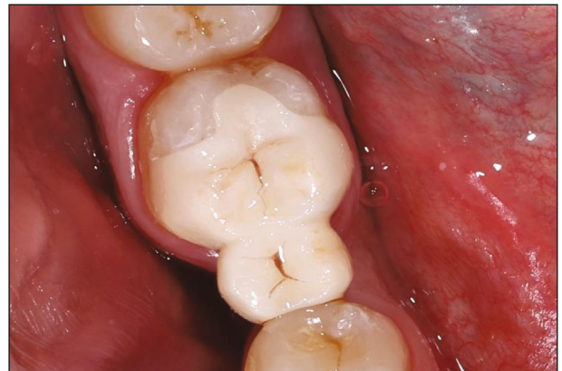
FIGURE 8: Occlusal view of resin-bonded inlay-retained cantilever fixed dental prosthesis immediately after insertion.

the tooth was thoroughly dried with air stream. After that, the enamel and dentin walls were conditioned with corresponding primer (Compobond LCM Primer; Promedica) which was mixed according to manufacturer's instructions and applied for 30 seconds before dispersing the excess using gentle oil-free air stream. Then, the adhesive material (Compobond LCM Adhesive; Promedica) was mixed according to manufacturer's instructions and applied for 15 seconds before removing the excess using gentle oil-free air stream and light cured for 15 sec. Finally, bonding surfaces of the prosthesis were primed with a ceramic primer (Aureocem DC Ceramic Primer; Promedica) using a microbrush. The primer was left for 60 s, and the excesses were removed with an oil-free air stream. After that, the cement (Aureocem DC Automix, Promedica) was distributed over the resin-bonded IRCFDP bonding surfaces, and the prosthesis was seated in place (Figure 8). Steady finger pressure was applied during the setting time. After cementation, the function and occlusion were checked using articulator papers.