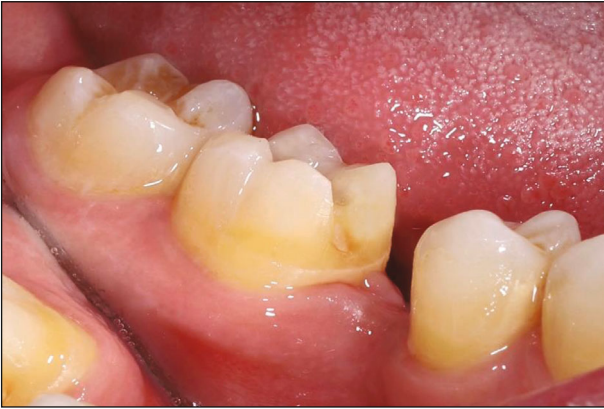
FIGURE 4: The mandibular right second molar after preparation.