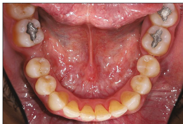
FIGURE 3: Pretreatment occlusal view of mandibular arch.

nector were approximately 4 mm in height and 4 mm in width. After try-in stage (Figure 7) and to remove the residues of the saliva and blood, the bonding surface of resin-bonded IRCFDP was cleaned using hot water steamer. Then, the bonding surface of the inlay retainer and the buccal and lingual retainer wings were airborne-particle abraded with 50 \mu\text{m} \text{Al}_2\text{O}_3 for 10 seconds with 0.1 MPa pressure [19]. After that, the prosthesis was ultrasonically cleaned for