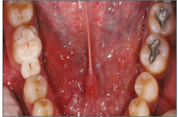
FIGURE 7: Evaluation of resin-bonded inlay-retained cantilever fixed dental prosthesis before cementation.

A rubber dam was applied during adhesive cementation, and the abutment tooth was cleaned with pumice. Then, the preparation surfaces of the abutment tooth were etched with a 37% phosphoric acid gel (Cica; Promedica) for 15-30 sec (according to the tooth structure; dentin or enamel). Then, the acid etch gel was sprayed off with water for 15 sec, and