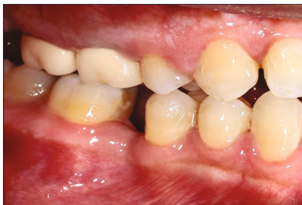
FIGURE 2: Pretreatment lateral view of mandibular arch.