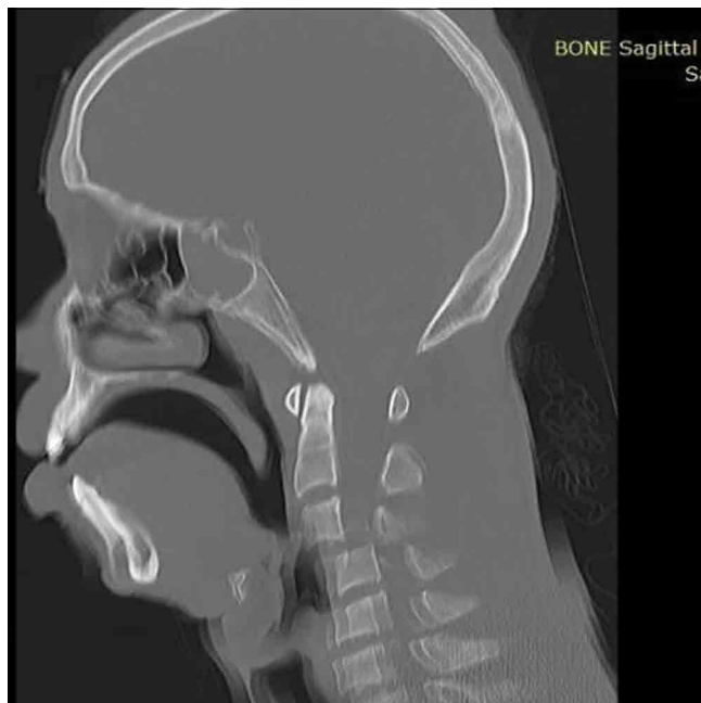
Figure 1: Cervical spine CT sagittal bone window showing C3 on C4 anterior subluxation.

The impact of CT artifact on the patient may include unneeded surgery, transfer to another facility and delay in critical decision making due to fear of secondary cervical spinal cord injury. [1,6] This may be a diagnostic puzzle for both the radiologist and attending clinicians. The index patient with severe traumatic brain injury and the radiologist reported 75% C3 on C4 anterior subluxation caused initial suggestion of urgent need for spinal stabilization. A further critical review of the cervical spine CT bone window showed double shadow with the reported subluxation. The findings necessitated plain radiograph which was normal. Computed tomography has offered better resolution and anatomical definition of the spine but there is a baseline role of the