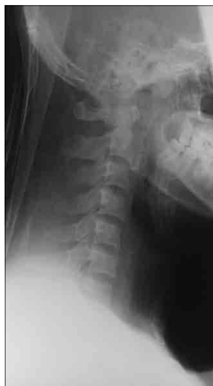
Figure 2: Lateral cervical spine X-ray taken with rigid neck collar 2 nd day posttrauma in intensive care unit.

routine plain spine X-ray which should be explored before critical decision making to prevent the stress of unnecessary surgery or transfer. [7]