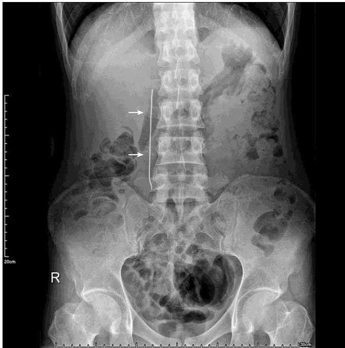
Fig. 1. Standing X-ray films showed a metal shadow in the right abdominal quadrant between the third lumbar vertebra and the fifth lumbar vertebra level.