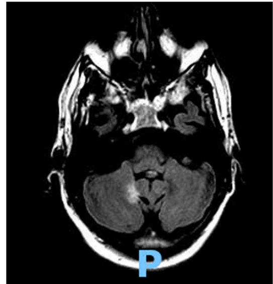
Fig. 3. MRI of the brain.

In order to determine the lung being the primary origin for SRCC, it is also important to exclude the possibility of metastatic with primary origin for SRCC elsewhere such as stomach, breast and prostate. Our patient failed to demonstrate any active malignancy of initial PET scan in other organ systems and underwent EGD with biopsies to rule out gastric origin of cancer. This conclusion is further supported with immunohistochemistry (positive CK7 and TTF-1 and negative CK20) which suggests primarily a lung cancer [7]. Fluorescence in situ