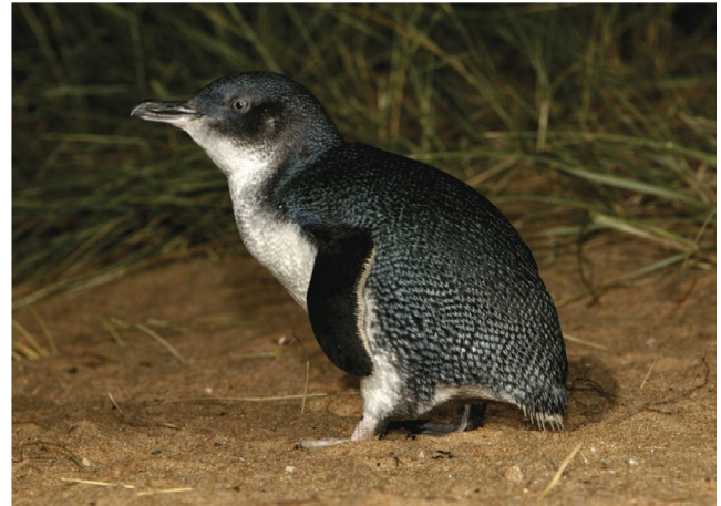
FIGURE 1 Little penguin ( Eudyptula minor ) from the Phillip Island mega colony.

The little penguin ( Eudyptula minor , Figure 1) is an example of a seabird showing fast-strategists' characteristics compared to other seabird species (Lewis et al., 2012). They have a relatively early age of sexual maturity, usually between two and three years (Priddel et al., 2008), coupled with a relatively short average life span (around 6.5 years, Dann et al., 2005; but 14 years when excluding fledglings, Zimmer et al., 2011, Ramírez et al., 2015). With these particular life-history traits, there is selective pressure to maximize reproductive output and lifetime fitness (Abraham & Sydeman, 2006), while reducing deleterious impacts on animals' fitness from unfavorable environmental conditions (Ponchon et al., 2014; Saraux et al., 2011). Contrasting reproductive strategies have been documented among little penguin populations. Indeed, the little penguin is one of the few examples of a seabird potentially undertaking multiple breeding events within a year (i.e., additional breeding attempts out of the regular breeding season), although the success of such additional attempts varies among years and between populations as a likely response