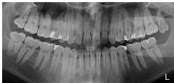
Fig. 2 Coincidental observation in a panoramic radiograph section of a male Swiss individual depicting bilateral two-rooted mandibular second premolars. Kannan et al. [56] described a similar clinical case with contralateral two-rooted mandibular second premolars in an Indian individual. Multiple root canals can also be presumed in the second maxillary and first mandibular premolars

a significantly higher number of RCC type 1–2–1/1 (OR [95%CI]=2.05 [1.27, 3.33]) and 2–2–2/2 (OR [95%CI]=2.32 [0.65, 8.36]) were observed in male than in female patients (Additional file 1: Fig. S1, Additional file 2: Fig. S2, Additional file 3: Fig. S3, Additional file 4: Fig. S4, Additional file 5: Fig. S5).