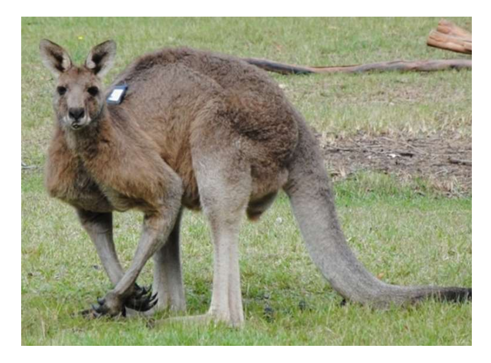
Figure 2. The position of the glue-on i-gotU GPS device on an individual. As seen, positioning the device just below the shoulders removes the stress placed on the adhesive when the kangaroo bends its neck and shoulder.

Individuals fitted with GPS collars required short handling times due to the ease of attachment. Collars were attached with suitable tightness around the neck to reduce movement but not cause stress or irritation. When attaching the glue-on devices, an electric shaver was first used to create a device-sized patch (retaining about 1 cm of underfur) on one side of the individual's spine between their shoulders to prevent self-removal (Figure 2). Surgical adhesive was applied to the back of the device, and the device was held on the shaved patch for about 30 s until the adhesive set. Total handling time was approximately 5–10 min per individual. After handling, animals were observed from a safe distance until full recovery. Recovery times (from initial sedation to actively walking again) ranged from two to four hours. Due to the large size of the animals, and to reduce additional handling complications, animals were not weighed. This limitation meant we could not use body mass as a variable between individuals. Animal capture and handling was approved by the University of New England Ethics Committee (AEC16-027) and the National Parks and Wildlife Services Scientific License (SL10172).