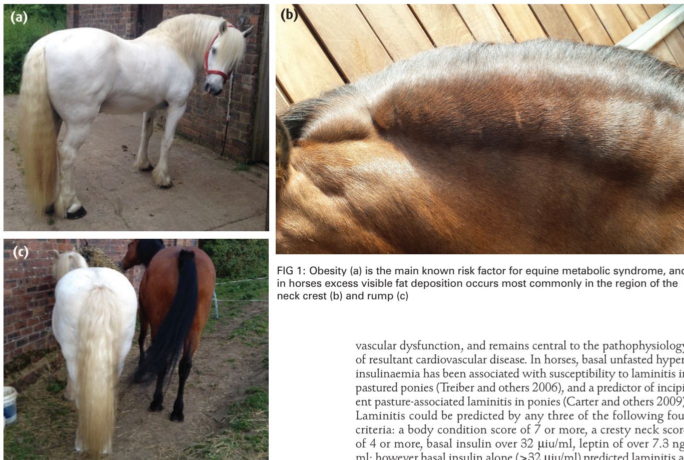
FIG 1: Obesity (a) is the main known risk factor for equine metabolic syndrome, and in horses excess visible fat deposition occurs most commonly in the region of the neck crest (b) and rump (c)

A small number of studies have attempted to tease out the possible role of fat in the development of EMS (Burns and others 2010). In horses, excess visible fat deposition occurs most commonly in the region of the neck crest and rump (Fig 1). Some researchers have suggested that neck crest adipose tissue is more active than omental adipose in horses, but the data are not conclusive (Burns and others 2010).