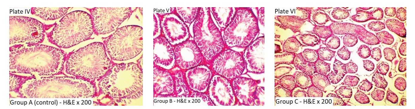
Figure 2. Histological section of the testis of rat. Plate I: Group A (control, only distilled water), Plate II: Group B (400 mg/kg of MEPO), Plate III: Group C (800 mg/kg of MEPO) (H&E × 200). MEPO: Methanolic extract of Portulaca oleracea .