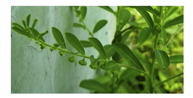
Fig. 1. The plant Phyllanthus niruri.

Control group received 200 \mu L phosphate buffer saline on the chorioallantoic membranes (CAM) using a 28-gauge hypodermic syringe to rule out any non-specific changes in the tested parameters. Group I was treated with 100 \mu g imidacloprid and group II was treated with 200 \mu L PNE (corresponding to 10 mg dried plant material for an egg of weight 60 g; hence, an equivalent dose of 167 mg/kg of human body weight). Administration of imidacloprid in the group I revealed the effect of insecticide and the same also served as positive control to study the detrimental effect of the