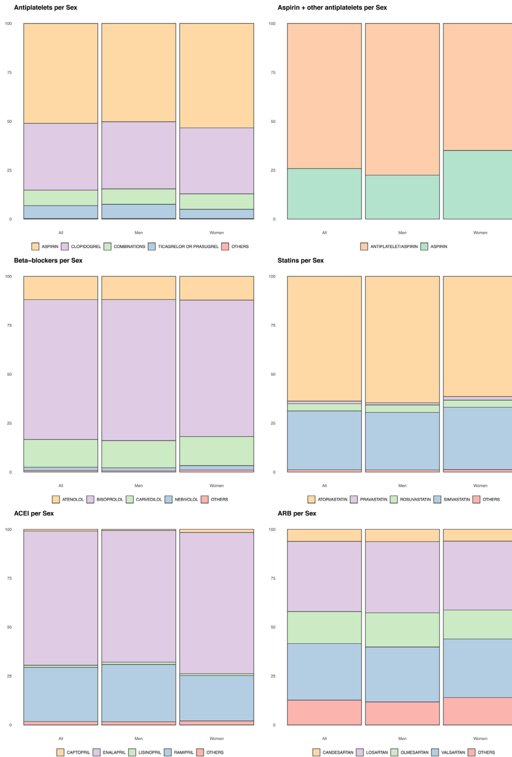
Figure 2 Drugs prescribed per gender. Fig. 2 depicts the different drugs prescribed overall, in men and women. Distribution between genders was compared using the Chi-Square test with all p -values < 0.001 . ACEI, angiotensin-converting enzyme inhibitors; ARB, angiotensin-receptor blockers.

comedications, anticoagulants and diuretics were the most prescribed in women, possibly related with their higher frequency of atrial fibrillation and heart failure than in men. Women initiated secondary prevention less frequently than men. 14-16,33-35 Nevertheless, the majority of our