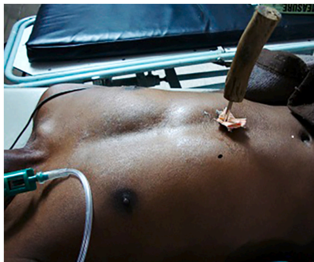
Fig. 1. Stab injury to abdomen with Ice pick in situ.

The Mattox manoeuvre is used for exposure of the suprarenal aorta [9]. Left-sided medial mobilization and rotation of the spleen, pancreas, stomach and kidney behind the perinephric fascia exposes the suprarenal aorta in the posterolateral direction [9]. In order to