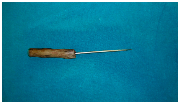
Fig. 4. Removed ice pick.