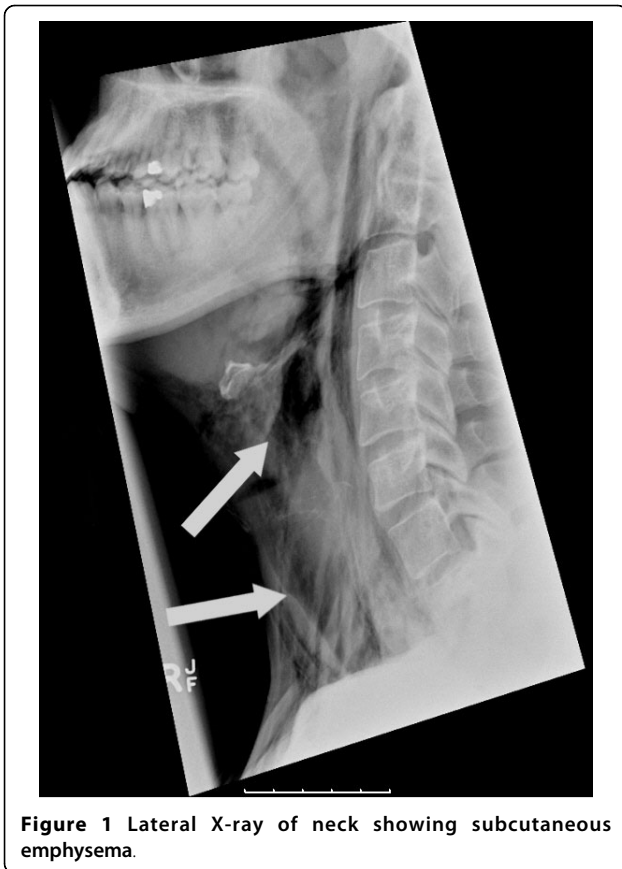
Figure 1 Lateral X-ray of neck showing subcutaneous emphysema.

He was admitted overnight and kept nil by mouth pending further investigation. He was given IV normal saline 1 litre every eight hours and started on IV antibiotics: cefuroxime (1.5 g three times per day) and metronidazole (500 mg three times per day). A water soluble contrast (Gastrograffin) swallow was performed the next day to detect a possible oesophageal perforation; however, no leak was found. A computed tomography (CT) scan of his neck and chest taken later that day showed extensive surgical emphysema in the pre-vertebral and pre-tracheal compartments of the neck in communication with pneumomediastinum, but the scan did not identify a perforated viscus or any fluid collections. Slices of this study are shown in Figure 2.