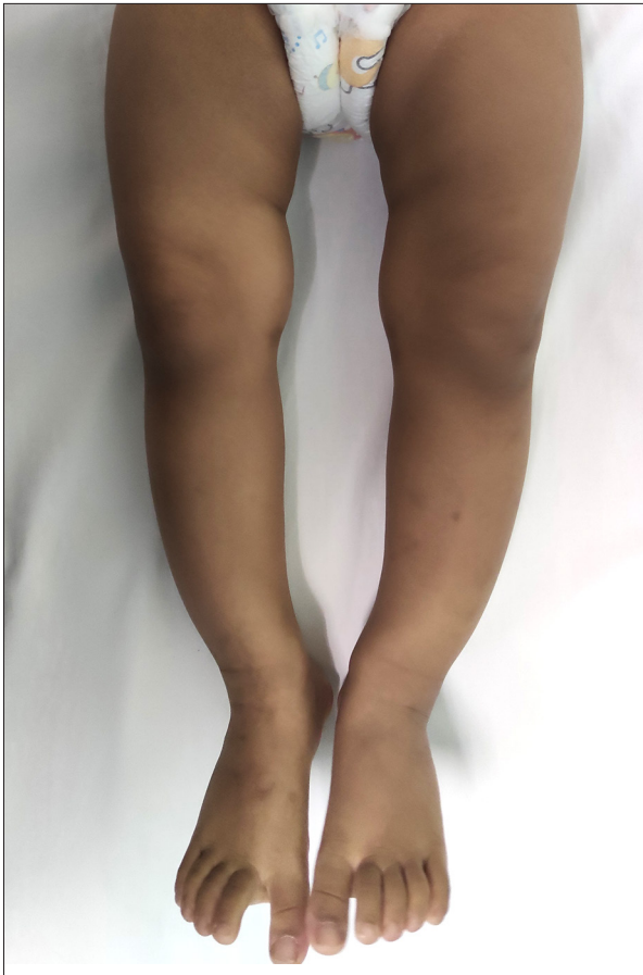
Figure 4. After 6 months of follow-up, the bowing of legs improved.

Subsequently, her calcium level improved to 2.02 mmol/L on day 3 of admission. She was discharged with oral calcium carbonate 500 mg 3 times daily (elemental calcium 60 mg/kg/day), oral calcitriol 0.5 mcg once daily for 2 weeks (50 ng/kg/day), and oral cholecalciferol 2000 IU once daily. Subsequently, her results returned with a very low level of 25-hydroxyvitamin D at 11 nmol/L (normal: >50 nmol/L), while the intact parathyroid hormone level was very high at 54 pmol/L (normal: 1.96-8.49 pmol/L). She was also referred for regular follow-up at the pediatric endocrinology clinic. Her mother's 25-hydroxyvitamin D level was also checked and was found to be 32 nmol/L (normal: >50 nmol/L). She remained asymptomatic and was counseled for further treatment and follow-up.