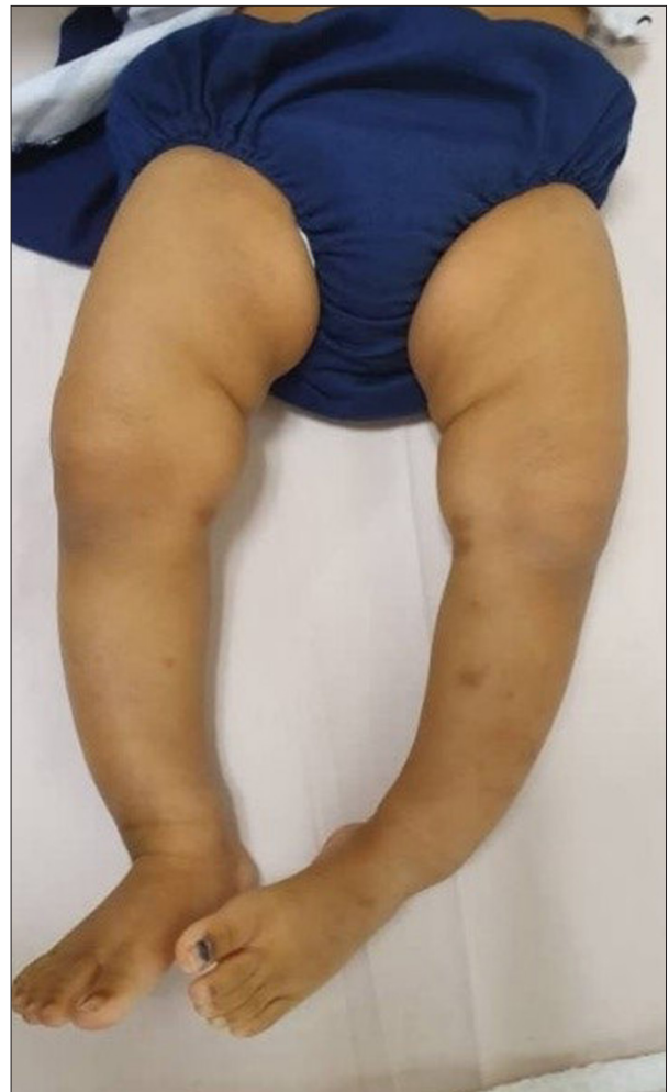
Figure 1. Bilateral bowing of the legs upon first presentation.

A 22-month-old Malay girl was brought by her mother to an urban academic primary care clinic in Selangor, Malaysia, in November 2020 with concerns regarding the shape of her child's legs and her abnormal gait. These were noticed by family members for a few months prior to the clinic visit. She began to walk at 13 months old, but her parents could not recall any obvious abnormality of her legs at that time. The child was otherwise well and active at home. There was no fever, history of seizures, diarrhea, or other systemic problems. She was born via spontaneous vertex delivery at term, with a normal birth weight of 3.56 kg. Her perinatal period was uncomplicated, and she was up to date with her immunizations. She had