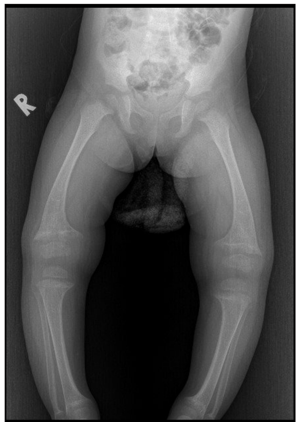
Figure 3. X-ray of lower limbs showing bowing of legs and widened metaphysis on bilateral knee joints.

Blood investigations sent urgently revealed severe hypocalcemia with a corrected calcium level of 1.53 mmol/L (normal: 2.25-2.75 mmol/L), but a normal phosphate level of 1.21 mmol/L (normal: 1.10-1.95 mmol/L) ( Table 1 ). Alkaline phosphatase was very high at 1296 U/L (normal: <281 U/L). Her hemoglobin level was 11.0 g/dL, which was within normal range (normal: 11.0-14.1 g/dL), renal profile was normal, and creatinine was 24 µmol/L (normal: 21-36 µmol/L). An X-ray of the left hand and forearm showed fraying and splaying of the radial and ulnar metaphyses, which is a feature of rickets. There was also concavity or “cupping” of both metaphyses ( Figure 2 ). There was no acute fracture or joint dislocation. An X-ray of