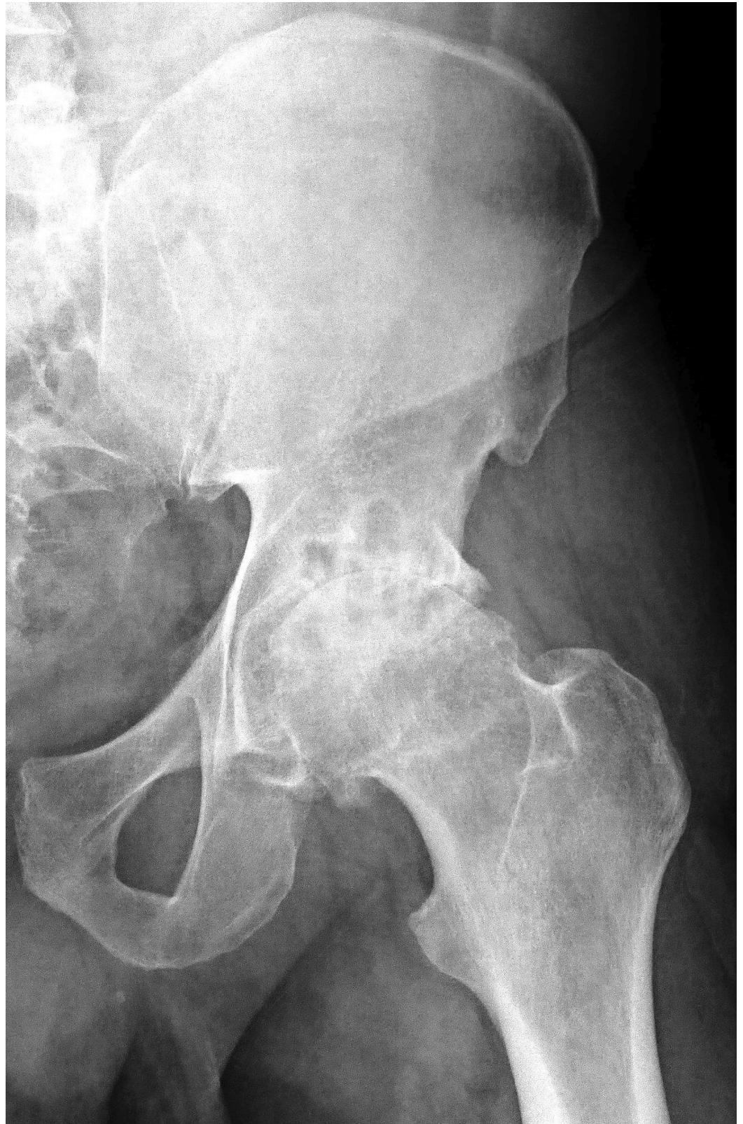
FIGURE 1: Plain preoperative radiograph (anteroposterior view) of the left hip showing arthritis of hip.

The general physical examination was normal, and the local examination of the left hip revealed a fixed flexion deformity of 15 degrees with restriction of hip movements. A plain radiograph of the pelvis confirmed the diagnosis of left hip arthritis (Figure 1).