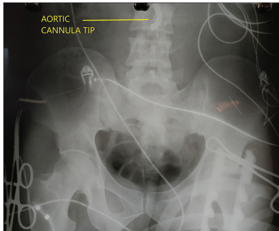
Figure 2: Abdominal X-ray showing dislodged aortic cannula tip at the level of third lumbar vertebra