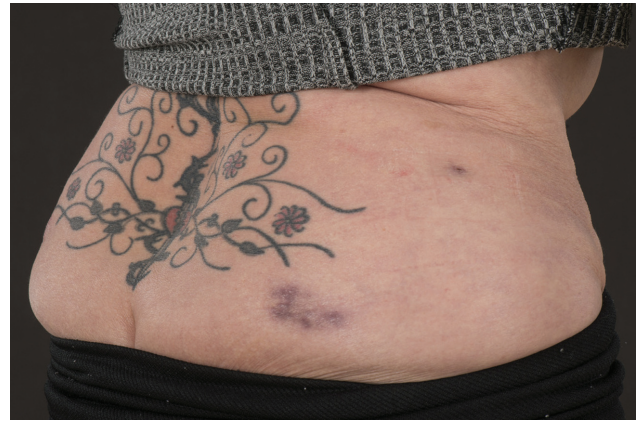
Fig. 4 Four months postprocedure—right hip and buttock region.

surgery. The treatment areas in question were the buttocks, hips, and flanks bilaterally. The patient reported shooting pains down the posterior aspect of her right leg, painful nodules in the injected areas, fevers, and severe pain when the treated areas came into contact with clothing. She had no past medical history and had received the treatment from a cosmetics clinic, where the injections were administered by a nonhealth professional. On examination, there were several firm nodules in the injected areas, tender to palpation with focal skin necrosis (see ► Fig. 1 ). Written informed consent was obtained from the patient and clinical photography was performed.