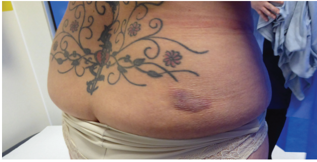
Fig. 1 Two months postprocedure—posterior view of buttocks.