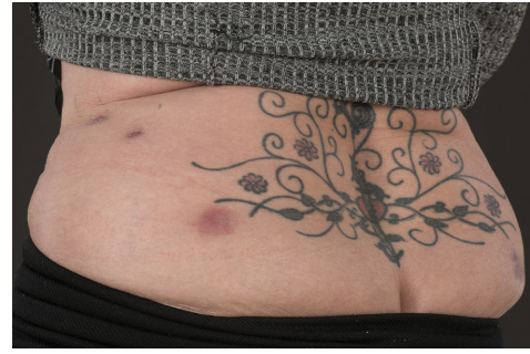
Fig. 2 Four months postprocedure—posterior view of buttocks.