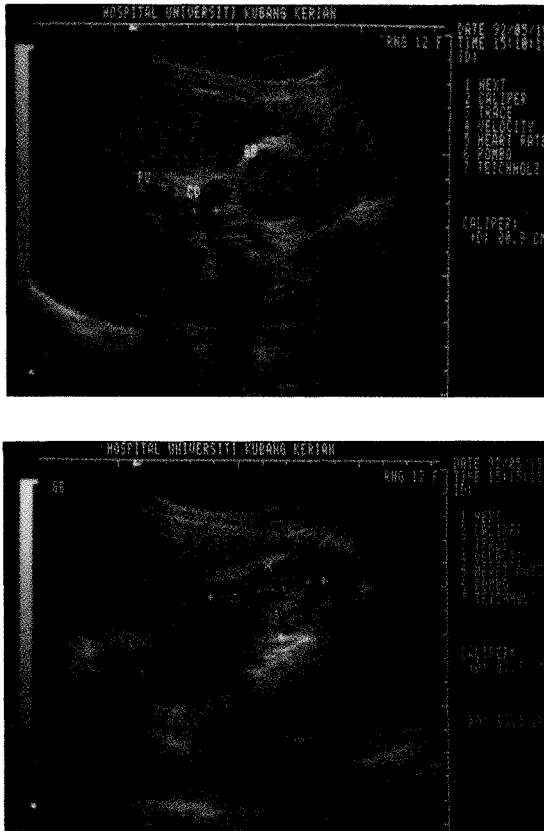
Figure 1 a, b Ultrasonogram of the gall bladder, sagittal (a) and axial scans (b) showing a hyperechoic soft tissue mass without acoustic shadowing filling the lumen.