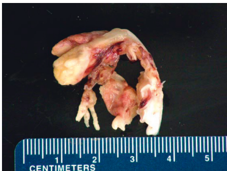
FIGURE 2: Gross pathology of the mitral valve with a left atrial polypoid mass measuring 4.0 cm × 1.5 cm.