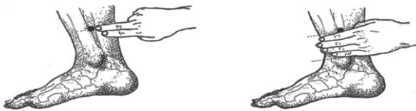
Figure 2. Image for Acupressure Sanyinjiao SP-6 point

emergency cesarean section, administration of the analgesic methods before the study, and reluctance to continue participation in the study.