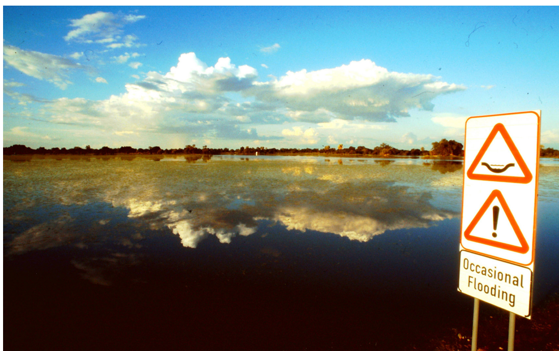
Fig. 3. Annual floods in the Ohangwena region pose major problems to everyone affected.