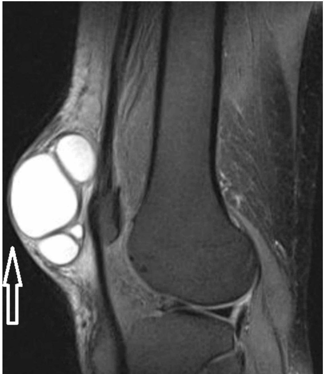
FIGURE 4: MRI of the right knee (coronal view) showing hypoechoic cystic loculated lesion in subcutaneous plane (arrow)

The patient was optimized for surgery and excision of the right knee and right leg swellings was done under spinal anesthesia (Figure 5).