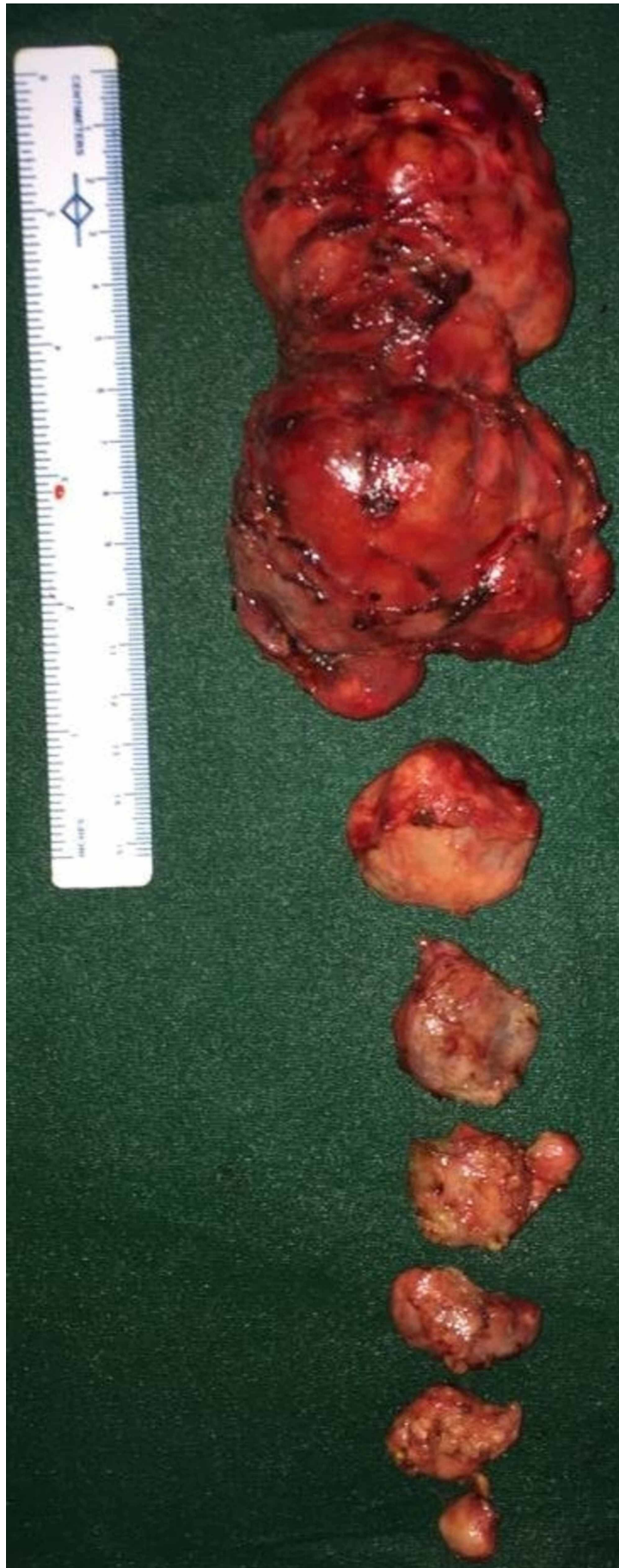
FIGURE 5: Excised specimen