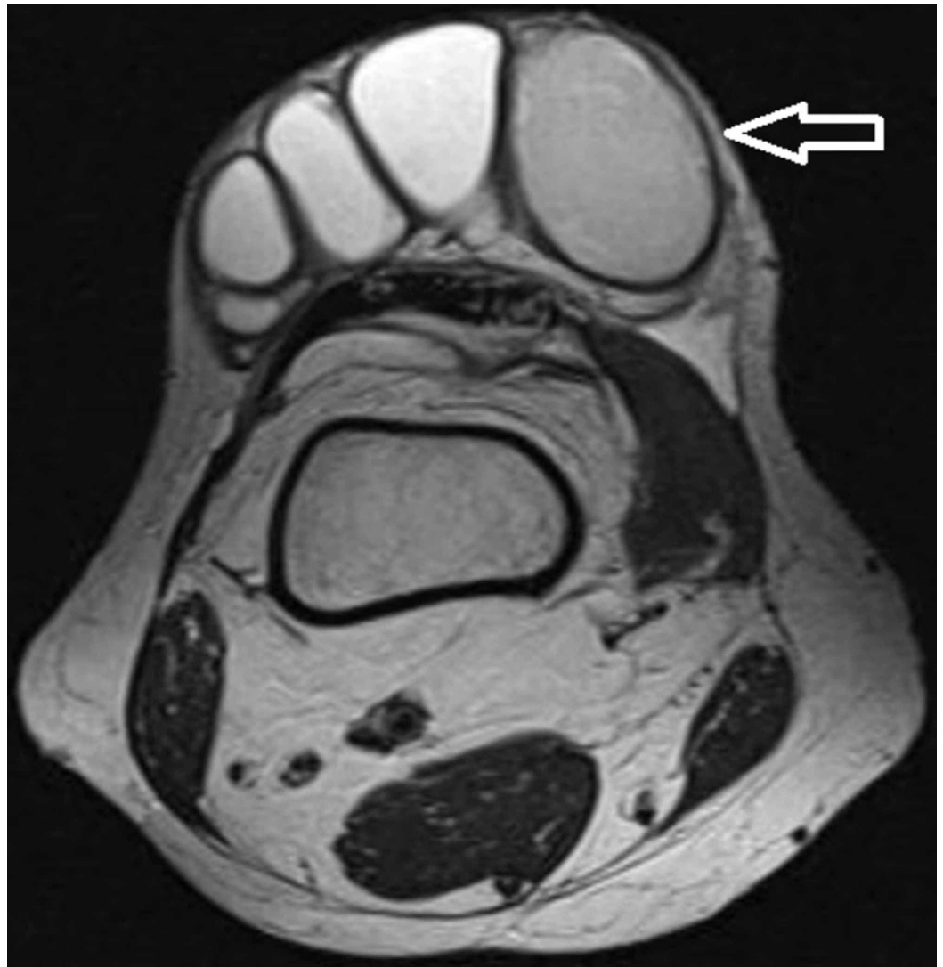
FIGURE 3: MRI of the right knee (transverse plane) showing hypoechoic cystic loculated lesion in subcutaneous plane (arrow)